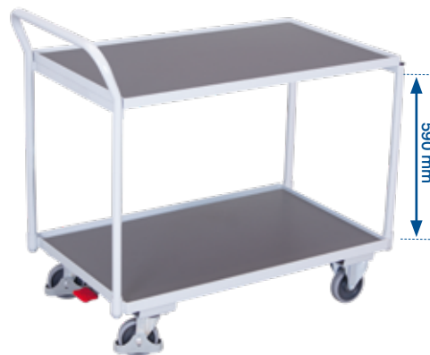
Table trolley with 2 load surfaces, RAL 7035