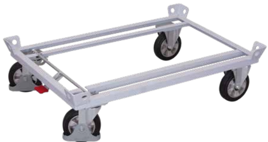
Steel-frame dolly, RAL 7035