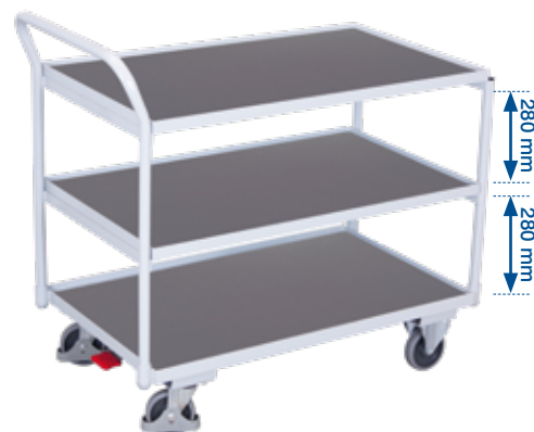
Table trolley with 3 load surfaces, RAL 7035

Load capacity shelf: 80 kg* EasySTOP swivel castors and foot guards for your safety!