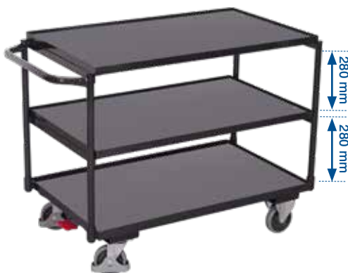
Table trolley with 3 load surfaces, RAL 7016

Load capacity shelf: 80 kg* EasySTOP swivel castors and foot guards for your safety!