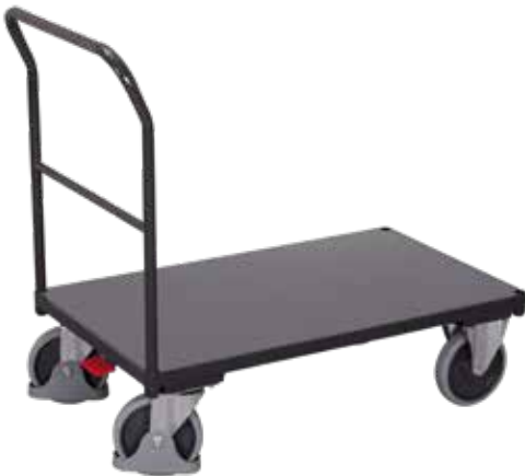
Pushbar trolley, RAL 7016

Modular system; Base structure with innovative frame section; Load surface of wood-based board, surface coated in dark grey; Trolleys powder-coated RAL 7016 anthracite grey or RAL 7035 light grey; Permanent surface protection; Impact- and scratch-resistant; Grey non-marking thermoplastic rubber tyres on plastic wheel rim with precision deepgroove ball bearings; Thread guard and foot guard; 2 EasySTOP swivel castors and 2 fixed castors.