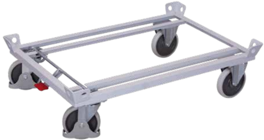
Steel-frame dolly, RAL 7035