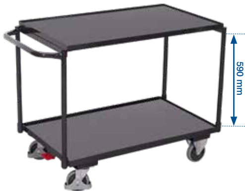
Table trolley with 2 load surfaces, RAL 7016

Modular system; Base structure with innovative frame section; Load surfaces of wood-based board, surface coated in dark grey; Set in angle-steel frame, edge = 15 mm high; Trolleys powder-coated RAL 7016 anthracite grey or RAL 7035 light grey; Permanent surface protection; Impact- and scratch-resistant; Grey non-marking thermoplastic rubber tyres on plastic wheel rim with precision deepgroove ball bearings; Thread guard and foot guard; 2 EasySTOP swivel castors and 2 fixed castors.