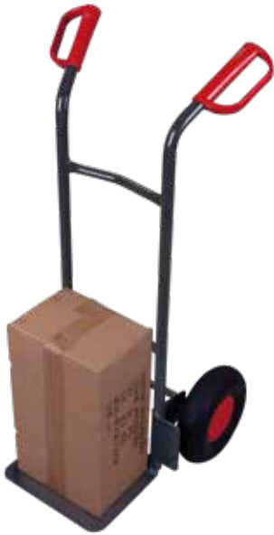
Tubular steel truck, RAL 7016