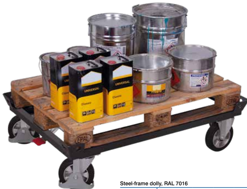
Steel-frame dolly, RAL 7016

EasySTOP swivel castors and foot guards for your safety! TR = Thermoplastic rubber tyres