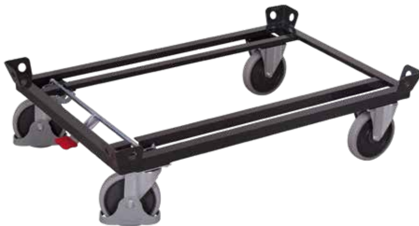
Steel-frame dolly, RAL 7016

Welded steel construction; Suitable for Euro pallets or cage pallets; Incl. locating cups; Dollies powder-coated RAL 7016 anthracite grey or RAL 7035 light grey; Permanent surface protection; Impact- and scratch-resistant; Grey non-marking thermoplastic rubber tyres on plastic wheel rim with precision deepgroove ball bearings; Thread guard and foot guard or elastic solid-rubber tyres on cast aluminium wheel rim with precision deepgroove ball bearings with foot guard; 2 EasySTOP swivel castors and 2 fixed castors.